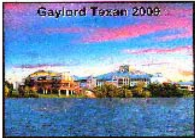
Gaylord Texan 2009